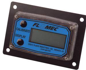
Pulse Access Dust Cover Installed

Used with the Remote Kit, this part replaces the dust cover that houses the electronic display. This module provides a digital, open collector (NPN) output signal. Use this combination to communicate to a PLC or other piece of electronic equipment.